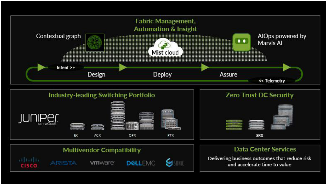
FIGURE 1 Juniper data center solution portfolio

Juniper® Data Center Assurance is a suite of cloud-based AIOps applications powered by the Marvis AI engine, the heart of Mist, Juniper’s AI-native networking platform. Data Center Assurance works with Apstra Data Center Director to deliver superior insights, speed, and reliability for data center network operations.